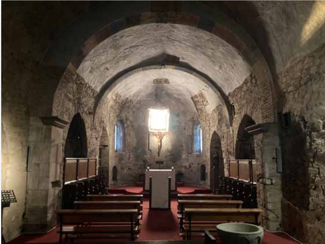
The Benedictine chapel at Rabanal del Camino mentioned by David on page 1